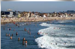
San Diego Beaches