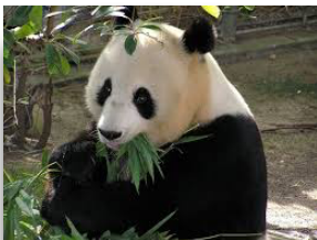
The World Famous San Diego Zoo