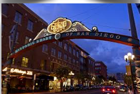
Gaslamp District Downtown